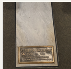
Side by Side at Albert's Grave

High five the Kool-Aid Man, say "Oh Yeah!" and snap a picture wherever you find him around the building.