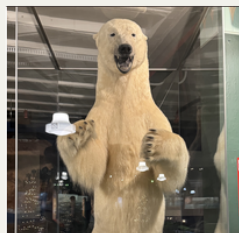
Step Into the Polar Bear Zone

Hide and see what you can find, there's adventure at every turn. Remember to snap a selfie to capture the fun!