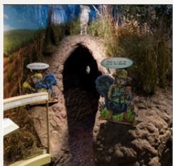
Peek-a-Boo in the Nook

Hide and see what you can find, there's adventure at every turn. Remember to snap a selfie to capture the fun!