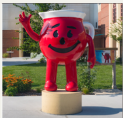
Be Kool with the Man

Step inside the Museum and explore three floors of fun! There are ten selfie spots to find, from colorful displays to iconic treasures, each perfect for a photo. Snap your photos, share your smiles, and don't forget to tag us on social media! Whether you're visiting solo, with friends, or with family, complete all ten stops and earn the title of Museum Selfie Master. Ready, camera in hand? Let the adventure begin!